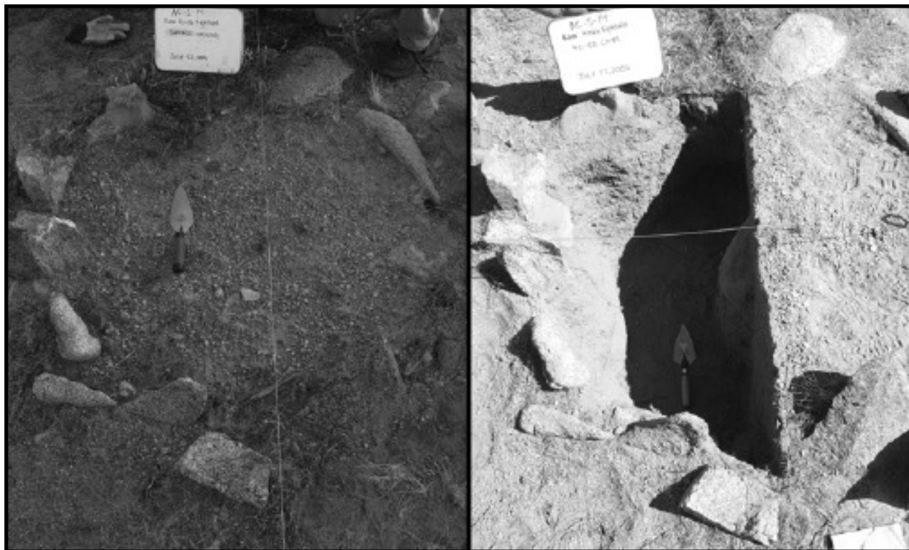
Figure 3. Rock ring at INY-7094 before and after excavation.

and their association with the feature was suspect, they were not extracted for AMS dating. Overall, charcoal density was less than 0.01 g/liter.