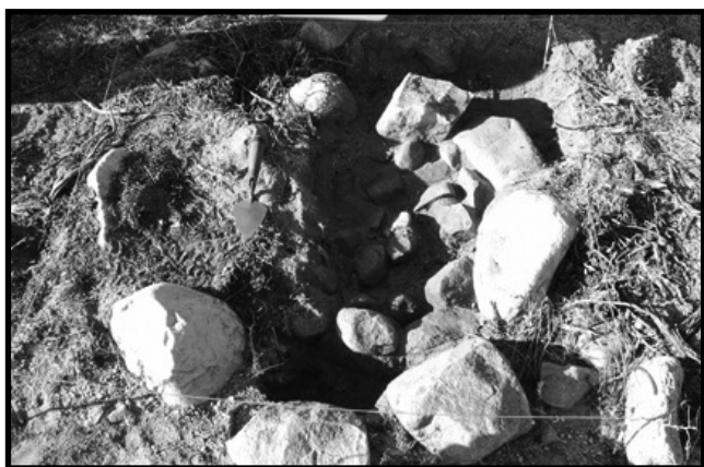
Figure 2. Rock Ring 1 bisected and exposed during excavation.

Two flotation samples of 1.5 liters each were analyzed from both RR1 and RR2. All four samples came from the 20-30 cm level below surface. Light fractions from the 2-mm, 1-mm, and 0.7-mm samples were analyzed for macrobotanical remains under a microscope. Heavy fractions were also analyzed for possible artifacts or cultural remains. Other than charcoal, RR1 did not yield any clearly